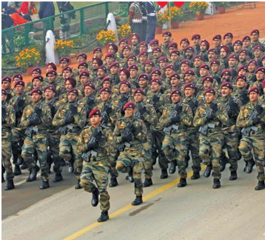
LONG MARCH AHEAD Para commandos during Republic Day parade

The only other occasion of a Special Operation contributing directly to a national aim or a cause was the airborne drop/assault by 2 PARA in 1971 War at Tangail, which was directly instrumental in the early capture of Dhaka and liberation of Bangladesh. It is only now that Prime Minister Narendra Modi has realised and exploited the full potential of the SOF/ Para SF in executing the 'surgical strikes', first against the NSCN(K) on 9 June 2015 in Myanmar, post the ambush on 6 Dogras in Chandel, and more importantly, in Pakistan Occupied Kashmir (POK) on 28/29 September 2016 against terrorist launch-pads after the terrorist attacks on the Uri military base. The impact of the surgical strikes was at the strategic domain and hence, a direct concern at the top political levels — the Prime Minister. The Indi-