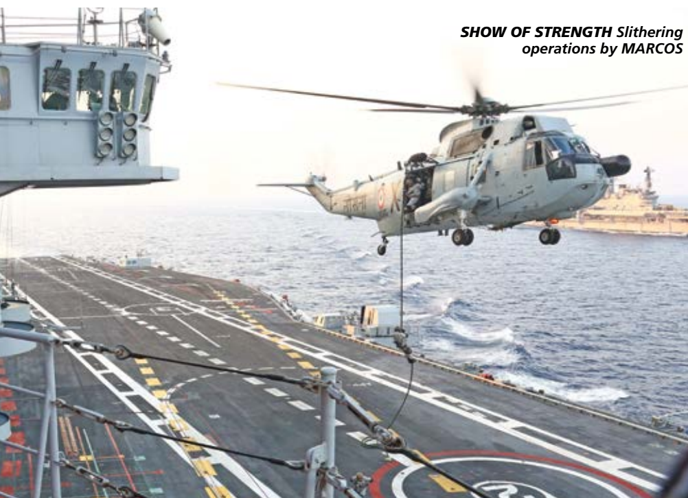
SHOW OF STRENGTH Slithering operations by MARCOS

tion gear, special mountaineering and climbing equipment, among others. The lack of GPMGs was recognised during the surgical strikes in Myanmar and Pakistan Occupied Kashmir (PoK). For many years now the SF are using the Russian origin Pika Machine Guns captured from foreign terrorists in Jammu and Kashmir. It is difficult to comprehend as to how the MHA succeeds in procuring state-of-the-art weapons for the CAPF, wherein the ministry of defence (MoD) succeeds only in delaying all procurements, even of similar weapons which are in service with the CAPF. It is hoped that this will get corrected by the impetus to modernisation and priority in making up critical voids accorded by the Prime Minister and defence minister after the surgical strikes.